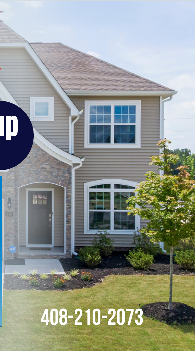
Amir Amiri 01384640